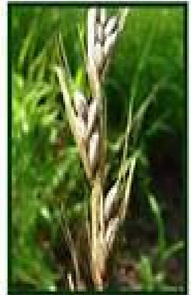
Wheat and Tares

https://images.search.yahoo.com/yhs/search;_ylt=A86.J78LKztZolAADEAPxQt.?p=what+are+tares+in+the+bible&fr=yhs-adk-adk_sbnt&fr2=piv-web&hspart=adk&hsimp=yhs-adk_sbnt&type=em_appfocus1_ff#id=1&iurl=https%3A%2F%2Fwww.yeshua.files.wordpress.com%2F2014%2F12%2Fwheat-and-tares-e1.jpg%3Fw%3D500%26h%3D407&action=click