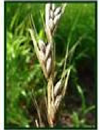
Wheat and Tares