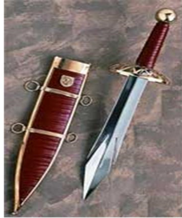
Sword of the Spirit

http://www.freebiblestudyguides.org/bible-teachings/armor-of-god-sword-of-spirit-word.htm