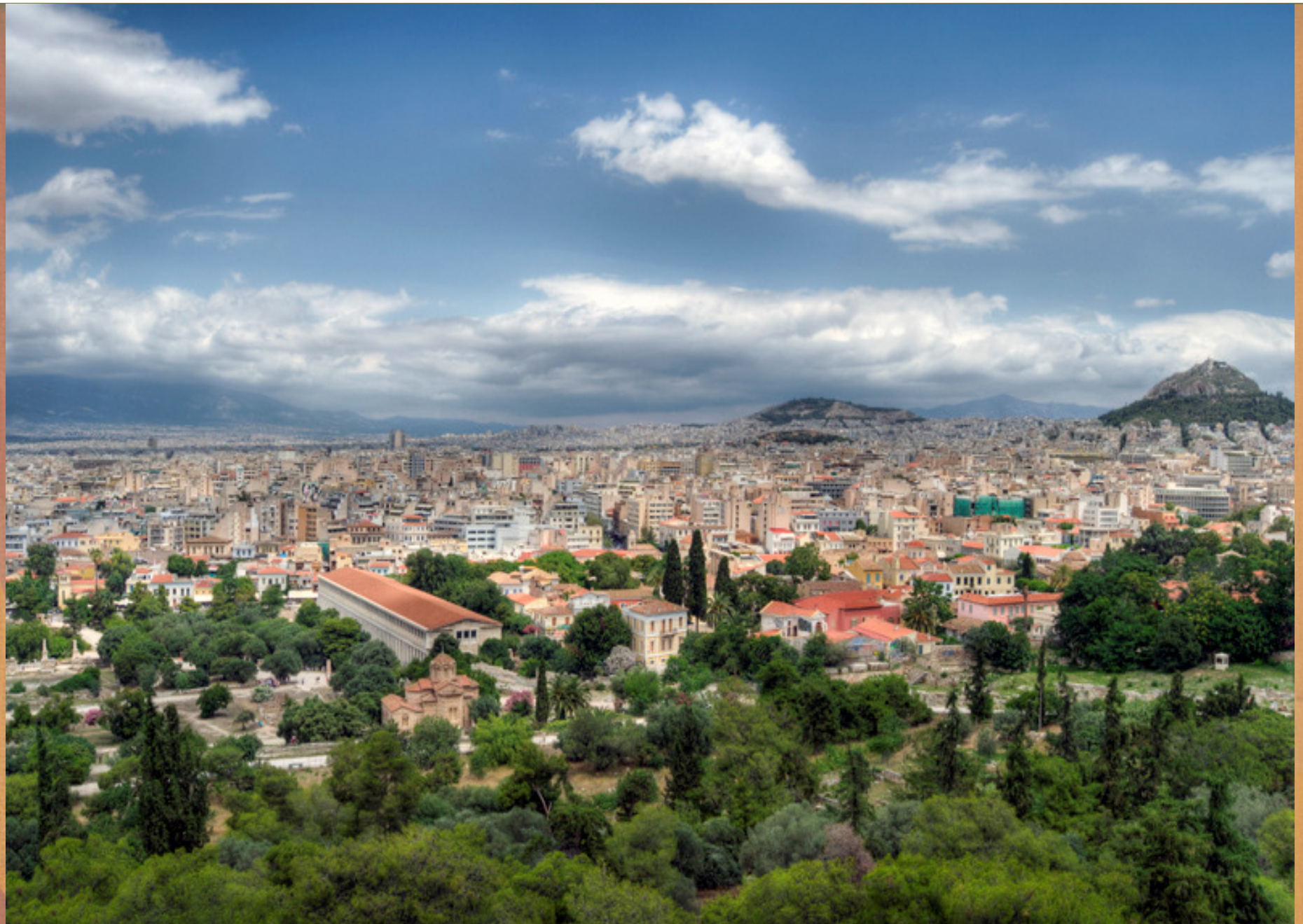
City of Athens Aerial from Mars Hill - Athens Greece