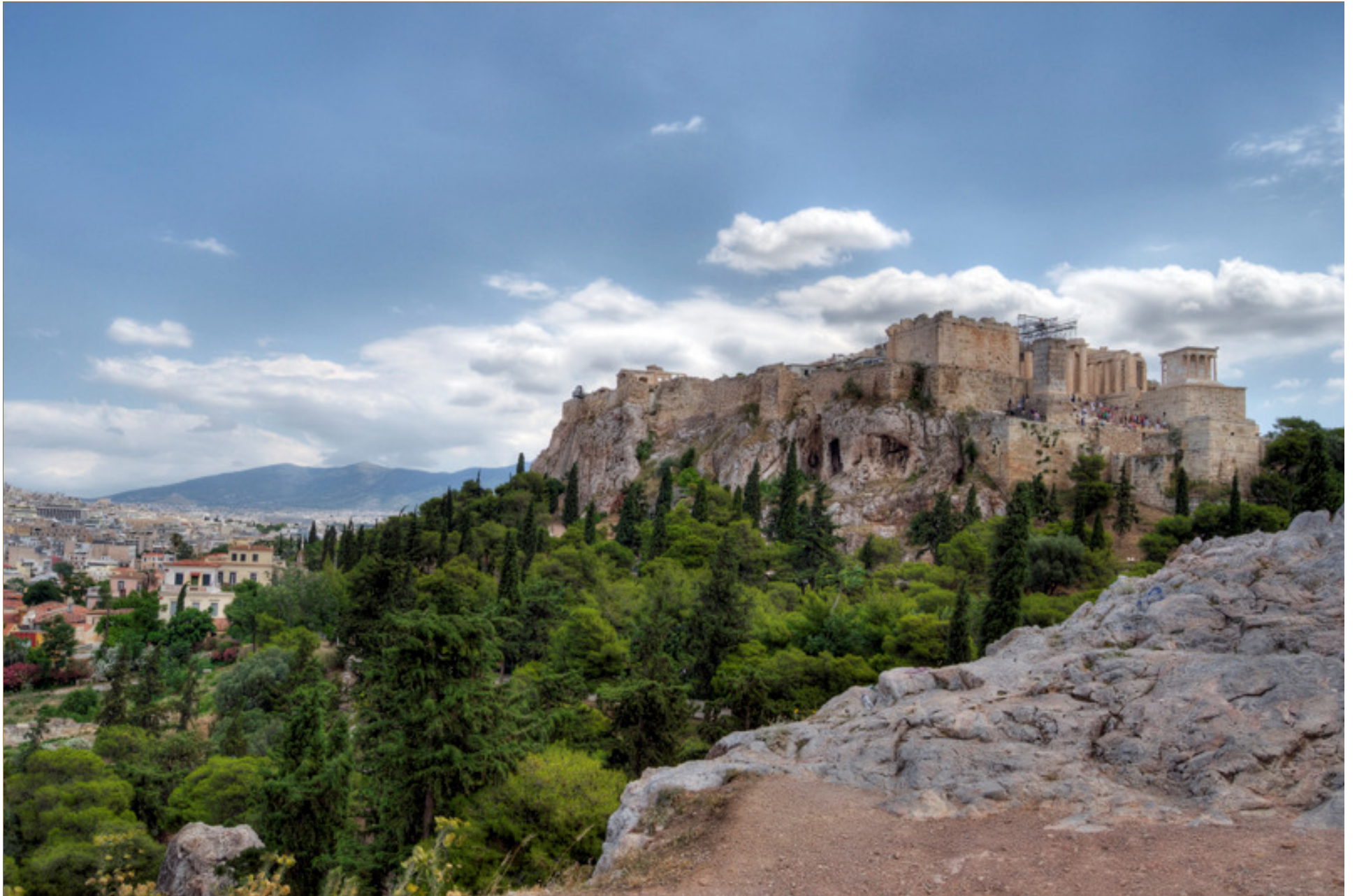
Athens Acropolis from Mars Hill - Athens Greece