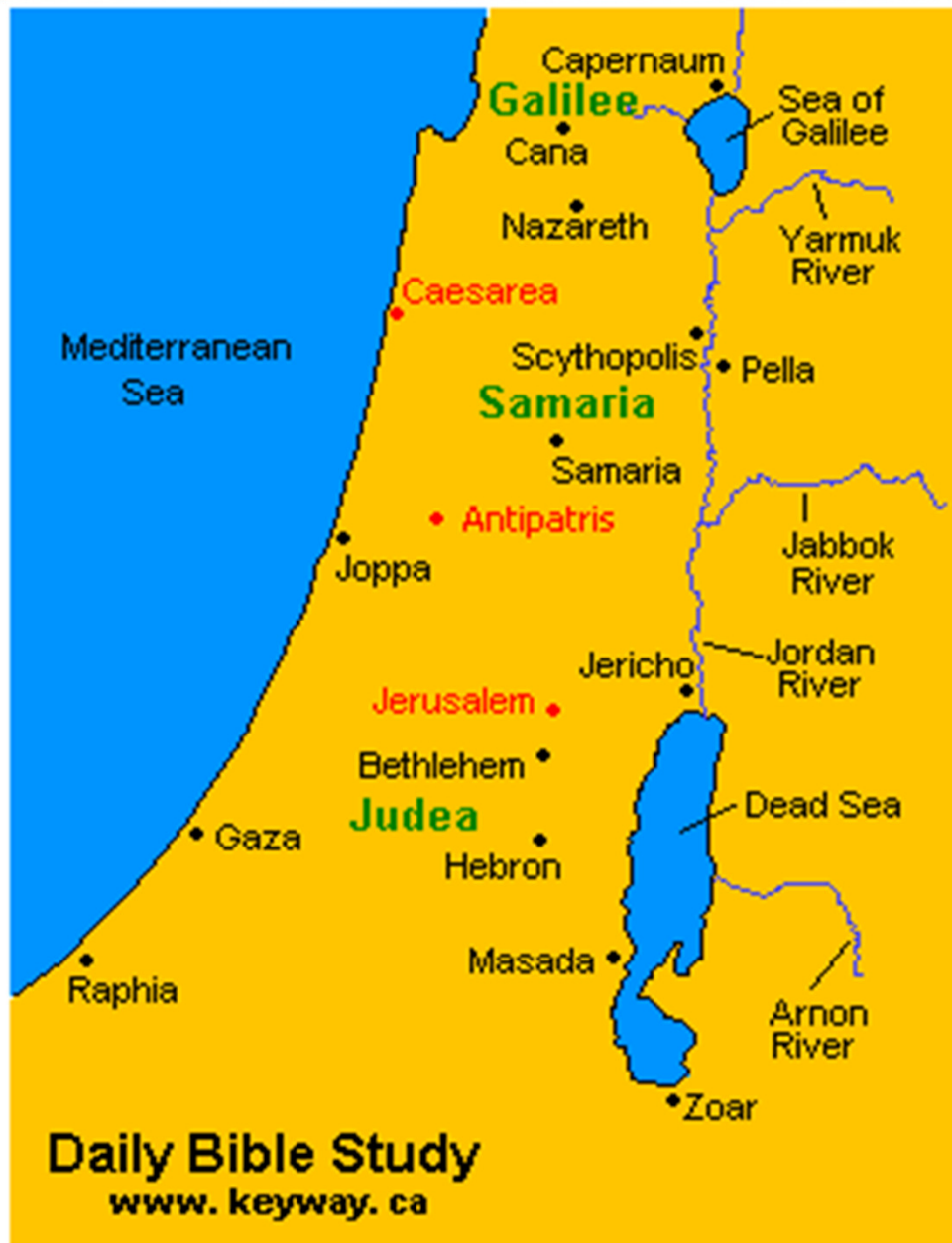
Paul's Roman Cavalry Ride