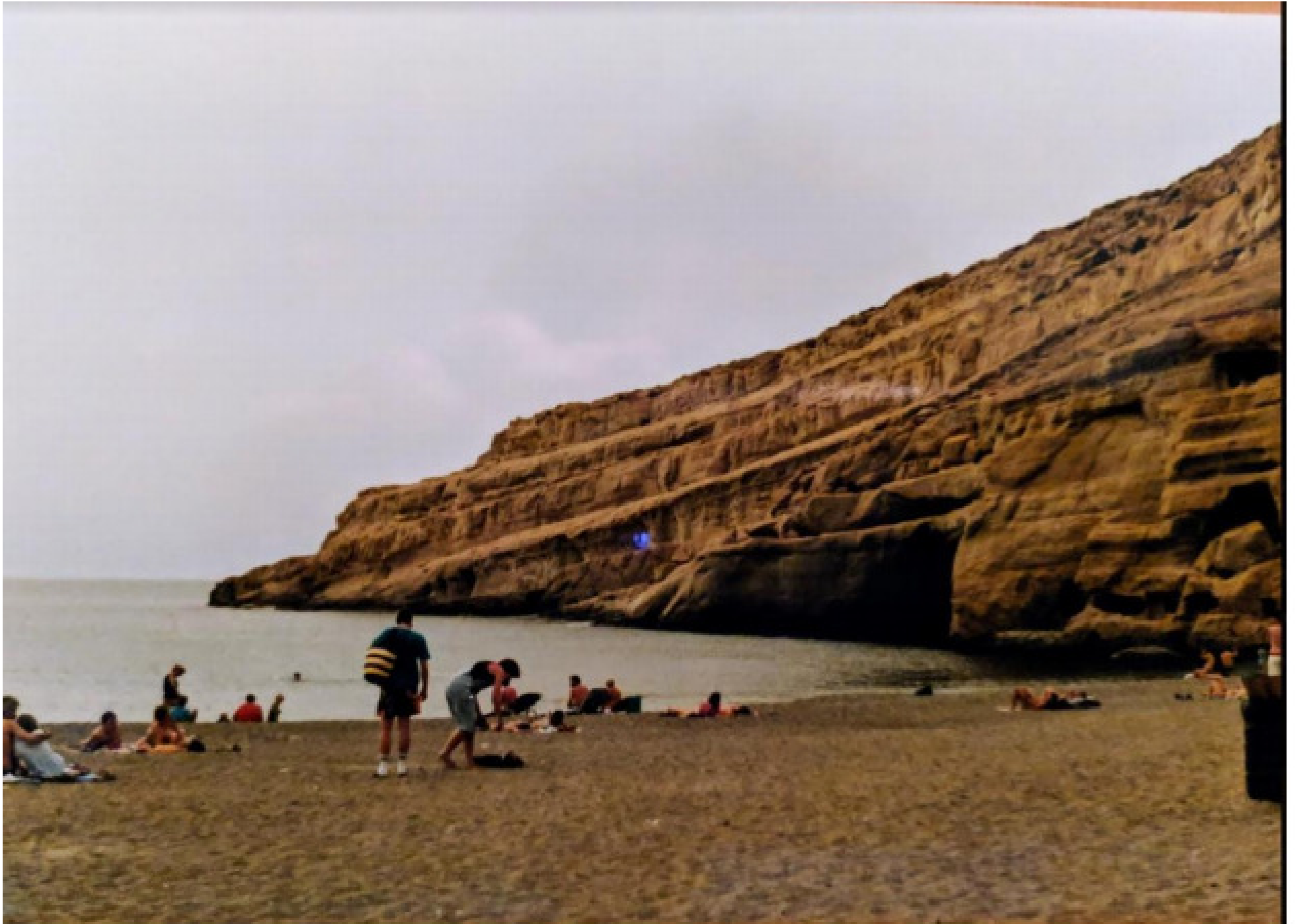
The end point of Matala