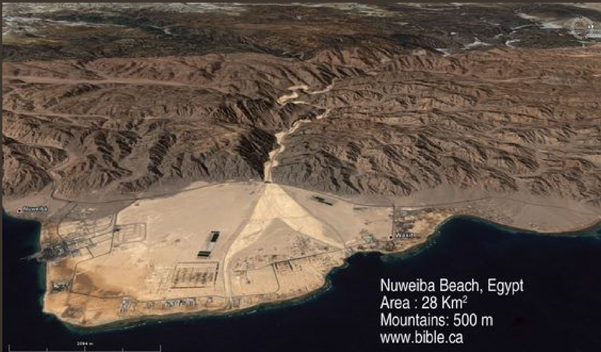
Nuweiba Beach, Egypt Area : 28 Km 2 Mountains: 500 m www.bible.ca